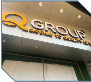
Acrylic Aluminum Channel Letter With ACP Background