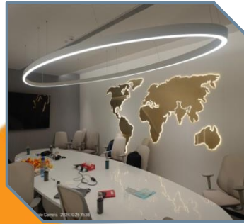
Stainless Steel champagne Gold decorative