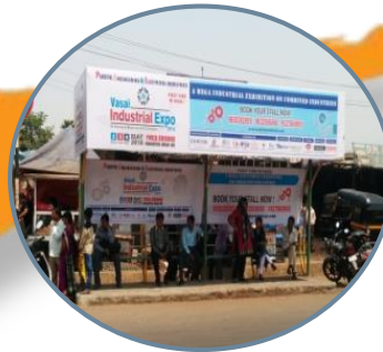
Bus Queue Stand