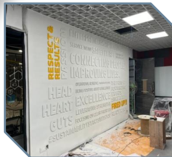
Wall Embossed Lettering