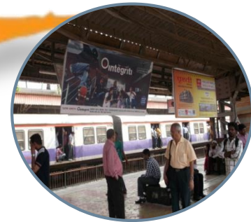
Station Platform Boards