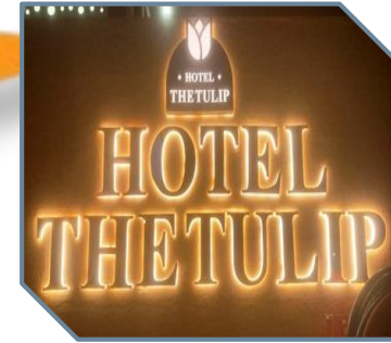
Stainless Steel Powder Coated Letter With Side LIT